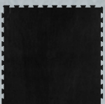
PAVIGYM B. MARBLE