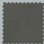
PAVIGYM STONE G.